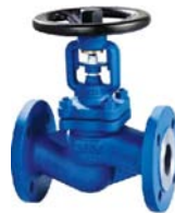
BELLOW SEAL GLOBE VALVE FLANGED PN16 / 25 / 40