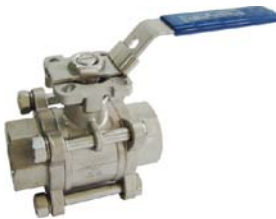
3-PC BALL VALVE WITH MOUNTING PAD ISO5211 THREADED BSP