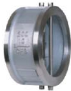
DUAL PLATE WAFER CHECK VALVE ANSI 150