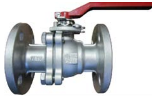
FIRE SAFE BALL VALVE FLANGED ANSI 150 / 300 / 600