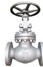
GLOBE VALVE FLANGED ANSI 300