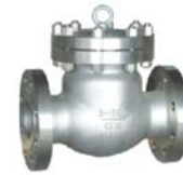
SWING CHECK VALVE FLANGED ANSI 150