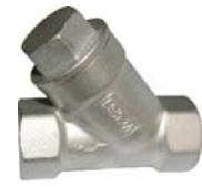
Y-STRAINER THREADED BSP / NPT