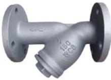
Y-STRAINER FLANGED ANSI 150