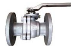
FIRE SAFE BALL VALVE ANSI 150 / 300 / 600