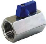
MINI BALL VALVE THREADED (F/F) BSP