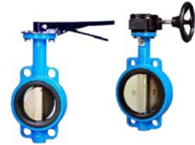
BUTTERFLY VALVE WAFER UNIVERSAL