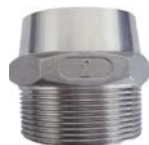
HEX WELD NIPPLE