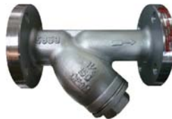
Y-STRAINER FLANGED ANSI 150