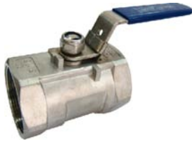
1-PC BALL VALVE THREADED BSP