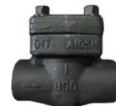
PISTON CHECK VALVE 800LB NPT