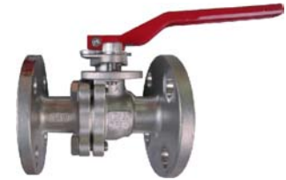
2-PC BALL VALVE FLANGED ANSI 150 / TABLE-E