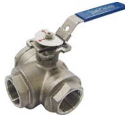
THREE WAY BALL VALVE WITH MOUNTING PAD ISO5211 THREADED (TYPE-L) BSP