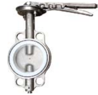
SS BUTTERFLY VALVE WAFER UNIVERSAL