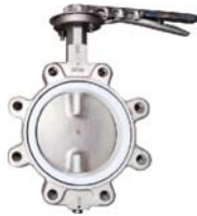
SS BUTTERFLY VALVE LUGGED ANSI 150 / TABLE-E