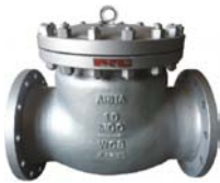
SWING CHECK VALVE FLANGED ANSI 300