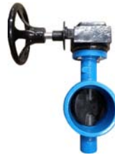
BUTTERFLY VALVE SHOULDER