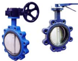
BUTTERFLY VALVE LUGGED ANSI 150 / TABLE-E