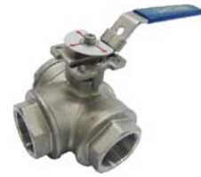
THREE WAY BALL VALVE WITH MOUNTING PAD ISO5211 THREADED (TYPE-T) BSP