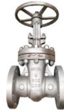
GATE VALVE FLANGED ANSI 300