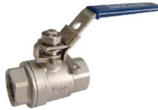
2-PC BALL VALVE THREADED BSP / NPT