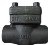
SWING CHECK VALVE 800LB BSP / NPT / SW