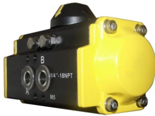
2 PISTON PNEUMATIC ACTUATOR SR / DA