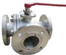
3 WAY T-PORT FLANGED ANSI 150