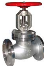
GLOBE VALVE FLANGED ANSI 150