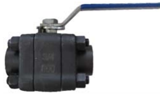
3-PC BALL VALVE 800LB BSP / NPT / SW