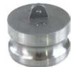
TYPE E ADAPTOR HOSE SHANK