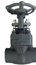
GATE VALVE 800LB BSP / NPT / SW