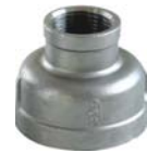
REDUCING SOCKET BANDED