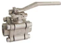
3-PC FIRE SAFE BALL VALVE BSP / NPT / SW