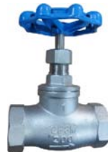
GLOBE VALVE THREADED BSP