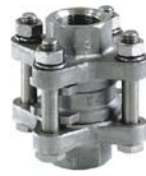
3-PC SPRING VERTICAL CHECK VALVE THREADED BSP / NPT