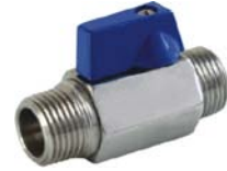
MINI BALL VALVE THREADED (M/M) BSP