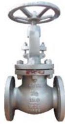
GLOBE VALVE FLANGED ANSI 150