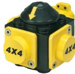
4 PISTON PNEUMATIC ACTUATOR SR / DA