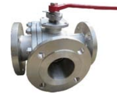
3 WAY L-PORT FLANGED ANSI 150