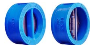
DUAL PLATE WAFER CHECK VALVE