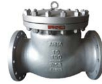
SWING CHECK VALVE FLANGED ANSI 150