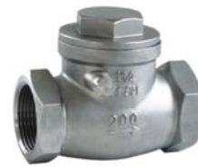
SWING CHECK VALVE THREADED BSP