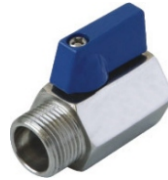
MINI BALL VALVE THREADED (F/M) BSP