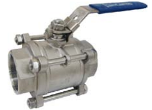
3-PC BALL VALVE THREADED BSP / NPT