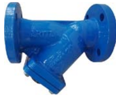
Y-STRAINER FLANGED TABLE-E